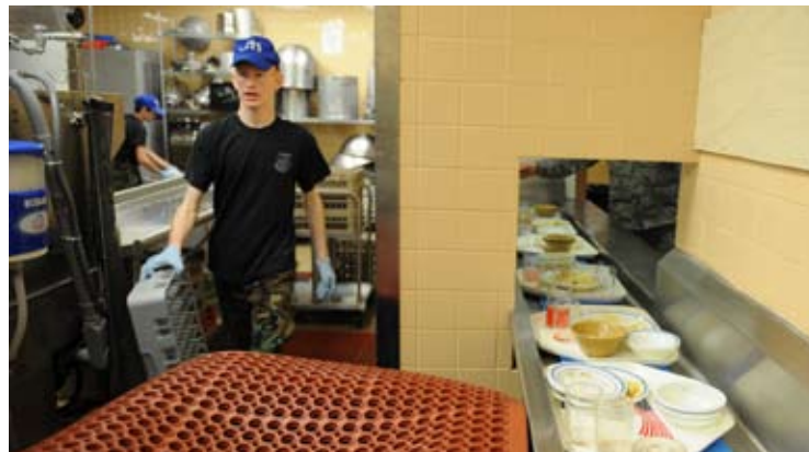
Members of the Civil Air Patrol work in the scullery on drill weekends, assisting in the dish clean-up procedures.