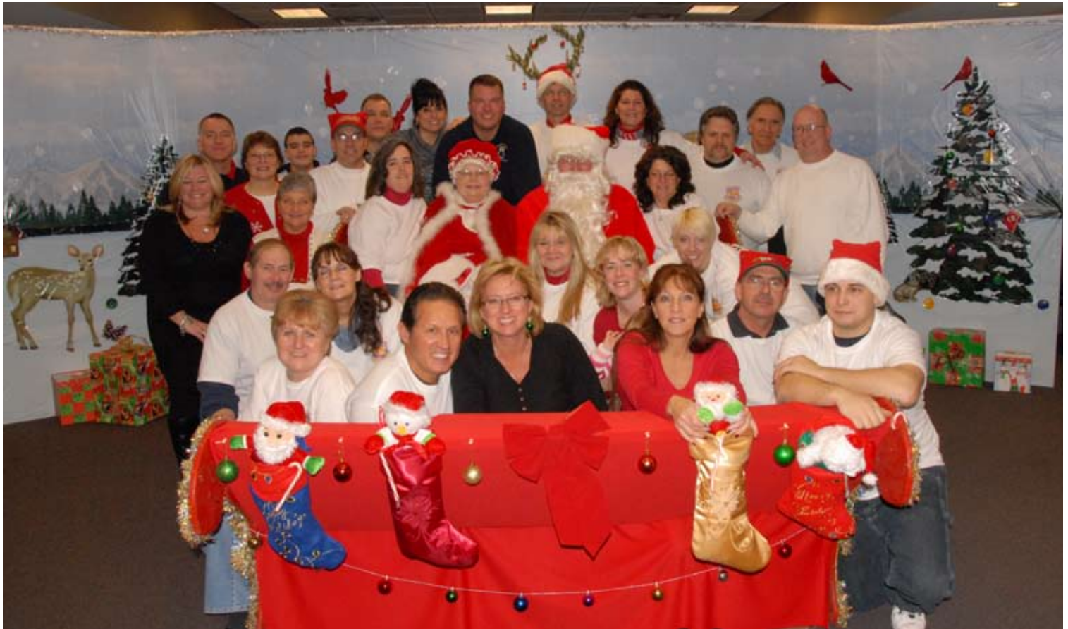
Everyone who participated in the "Lunch with Santa" event poses for a photo in the sleigh with Santa and Mrs. Claus.