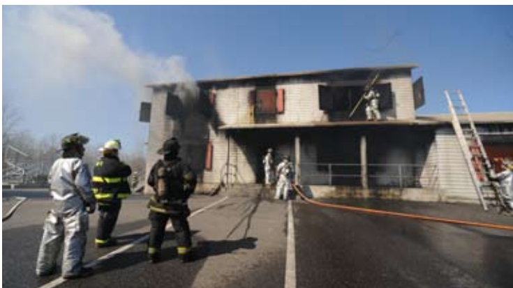
Members of the 106th Rescue Wing's Fire Department take part in training at a facility at Brookhaven National Laboratory on April 9, 2009.