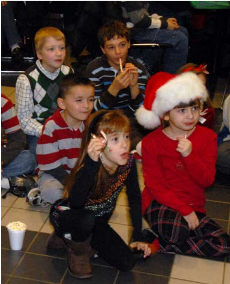
Children of all ages came out to the "Lunch with Santa" event at the base dining facility.