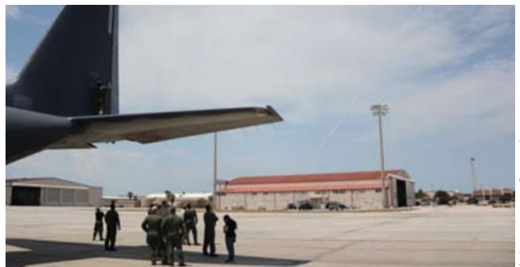
Members of "King 2" watch the launch of Space Transportation System Mission 125 from Patrick Air Force Base on May 11, 2009.