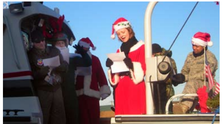
Support members of the 103rd Rescue Squadron also participated in the parade, here they offer their service as carolers.

103rd Rescue Squadron members were on unicycles, mini-bikes, quads and a 27' Boston Whaler fashioned as Santa's Sleigh with caroler's on board.