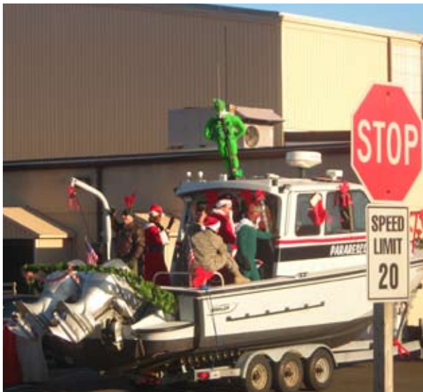
The 27-foot Boston Whaler was the key attraction during the parade.